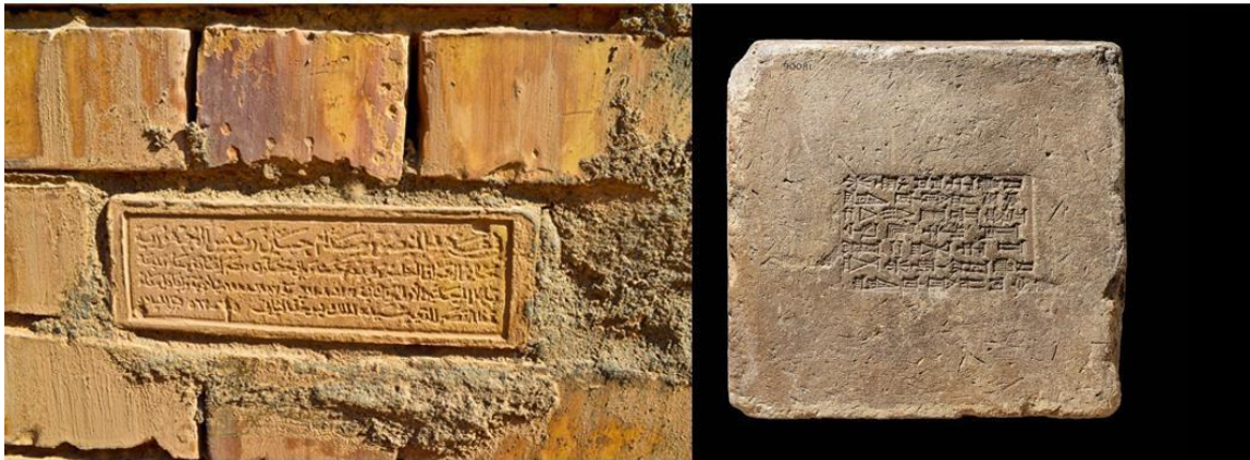
Figure 1: (Left) Brick at Babylon inscribed to commemorate Saddam’s reconstruction of the wall mimicking Nebuchadnezzar. Photo by Osama Shukir Muhammed Amin ( http://www.ancient.eu/image/9875/saddam-hussein-plaque-in-babylon/ ). (Right) An Original Nebuchadnezzar brick from 6 th -7 th c BCE Babylon. ( http://britishmuseum.withgoogle.com/object/a-building-block-from-babel ).

of Peru. During the reign of Saddam Hussein, the archaeology of Iraq went through a further transformation and was fused to his nationalist view of a powerful modern Iraqi nation-state, creating a Saddamist archaeological tradition. Saddam focused on Babylon specifically, and funded excavations and restorations of various ziggurats and sites using government resources. These restorations were part of a national strategy to create a unified “Babylonian” identity in Iraq, comparable to the Macedonian identity featured in Yugoslavian archaeological attempts to appropriate that aspect of the region’s past. The plan was to create a system of well-funded, restored, protected and accessible sites that could be visited by the Iraqi public. These efforts were a major part of Saddam’s 1970s literacy campaign to create a standard education system in Iraq. At these restored sites, Iraqis could explore reconstructed buildings, see artifacts, shop, eat, and learn about the Ba’athists national narrative of the country. Saddam made sure to have his name prominently inscribed on the bricks at his reconstructed Babylon as King Nebuchadnezzar had done before him (Figure 1) (De Cesari 2015:22-26; Amin 2019).