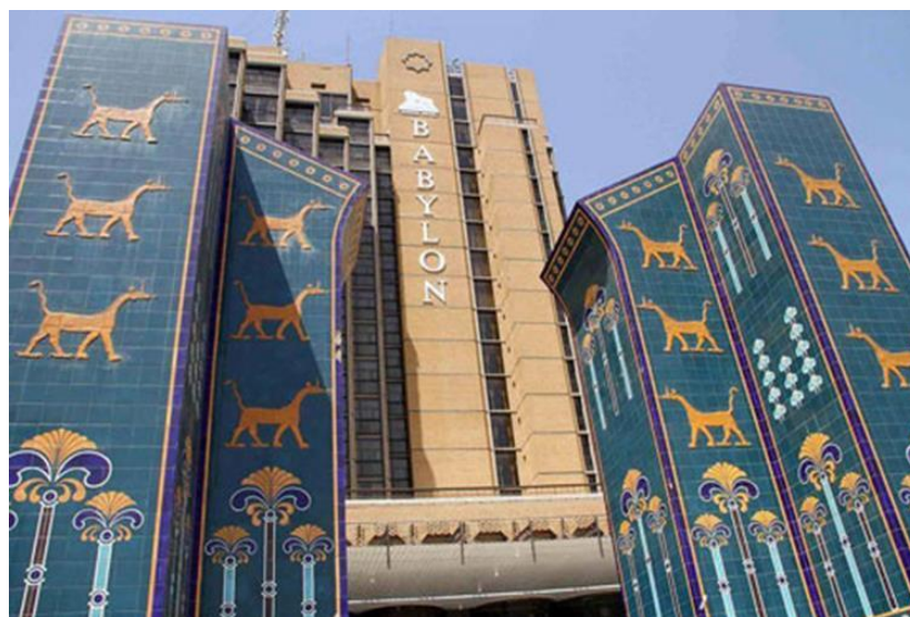
Figure 4: Stylized Ishtar gate entrance Baghdad.