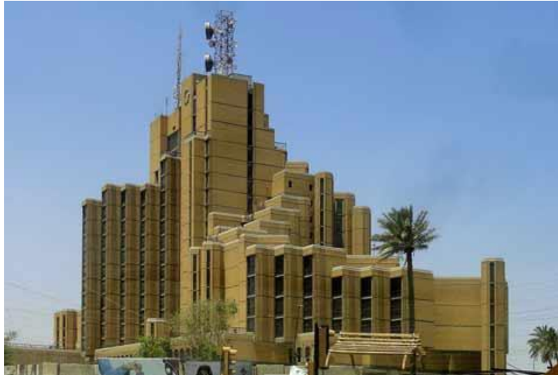
Figure 3: The Babylon Oberoi Hotel. Image from Building the Non-Aligned Babel: Babylon Hotel in Baghdad and Mobile Design in the Global Cold War (Kulić 2015:Fig. 12). ( http://journals.openedition.org/abe/docannexe/image/924/img-12.jpg ).

This attempt to engage in temporal appropriation of Babylonian culture did not end with the cooption of archaeological sites; even the military and infrastructure of Saddam's Iraq emulated this heritage. Weapon systems were renamed to elicit Babylonian symbology, such as the ubiquitous soviet T-72 battle tank, which in Iraqi service was slightly modified for desert use and nicknamed the 'Lion of Babylon' (Cordesman 2003:481-616). This adoption of symbols associated with the archaeological part is not unlike the uses of runes on Nazi uniforms and some German systems during WWII. Public architecture was also redesigned to emulate perceived Babylonian styles, as can be seen in the Babylon Oberoi Hotel (aka the Babylon Rotunda Baghdad Hotel) and several other buildings in Baghdad, including multiple half-scale Ishtar gate reconstructions at the entrances of public buildings and spaces (Figures 3 and 4). These building projects were halted during the latter half of the Iran-Iraq war, resulting in unfinished structures.