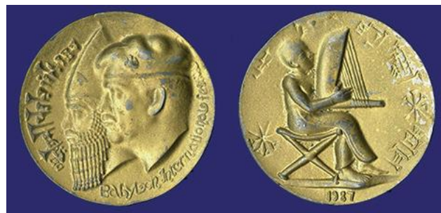
Figure 2: Commemorative coinage depicting Saddam and Nebuchadnezzar from 1987 ( http://www.researchgate.net/publication/285573015_POST-COLONIAL_RUINS_Archaeologists_of_political_violence_and_IS ).