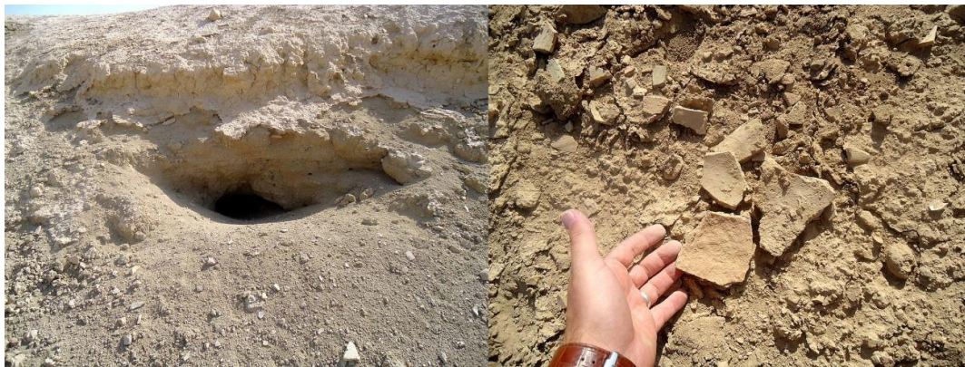
Figure 7: Looter's Pit and Pot Sherds on the surface at the site of Kish.