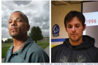
Similar cases yield very different results in Wisconsin prison system

MJS reporter Gina Barton in 2014 identified 2,700 state prison inmates eligible for parole but remaining in custody. A January 2015 story examined the current DOC practice of re-incarcerating ex-offenders without convicting them of new crimes.