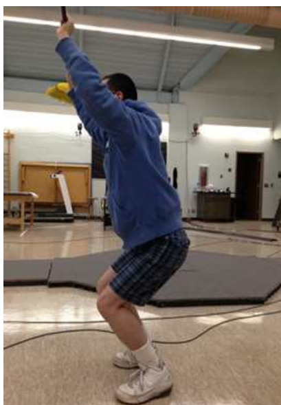
Fig.5: Deep squat test: participants squats down while keeping the dowel overhead and keeping the trunk approximately parallel with the angle of the tibia

overhead dowel above their head thus keeping the trunk approximately parallel with the angle of the tibia (Figure.5). Participants who can successfully squat down so that their thighs fall past horizontal while keeping their heels on the floor DO NOT have calf tightness, and were therefore excluded. Participants who cannot complete the deep squat as described DO have calf tightness and were included in the study (Butler, Plisky, Southers, Scoma, & Kiesel, 2010).