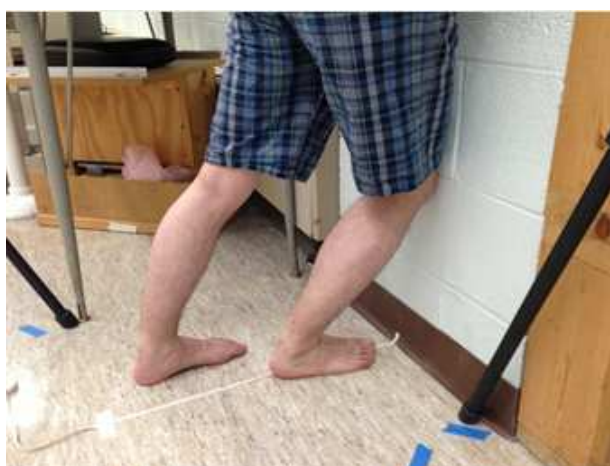
Fig.2: Participants positioning for the weight-bearing lung test.

heel, and knee in the sagittal plane, while planting the test heel firmly on the floor and flexing their knee to touch the wall. The opposite leg was used to maintain stability behind the test leg (Figure.2). Participants then lunged forward until their knee touches the wall. The stance foot was then incrementally moved away from the wall until maximal dorsiflexion, which was defined as the furthest distance between the great toe and the wall without the heel lifting off the ground and the knee still touching the wall, is reached. The investigator used a tape-measure the furthest distance (Vicenzino, Branjerdporn, Teys, & Jordan, 2006).