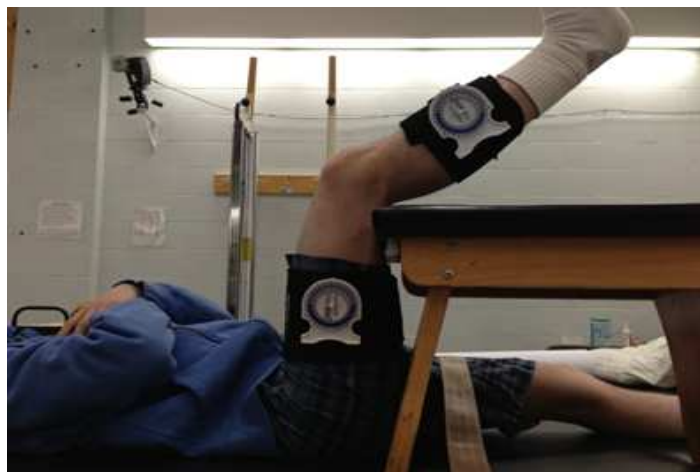
Fig.3: The angle was greater than 15^{\circ} or more from the vertical position indicated tight hamstrings and was a criterion for inclusion.

The participants first flexed the right thigh in 90^{\circ} , with the right ischial tuberosity placed against the box. The right mid-thigh was maintained by a Velcro strap secured to the box as well. Participants were then instructed to slowly extend their tested knee with the foot relaxed in plantar flexion to their terminal position, defined as the point at which the participants complain of a feeling of discomfort or tightness in the hamstring muscles or the investigator perceived resistance to stretch. Zero degree of knee extension from the vertical position was considered complete knee extension and full hamstring muscle flexibility. The measured angle greater than 15^{\circ} from the vertical position met the inclusion criterion of hamstring tightness (Kuilar, Woollam, Barling, & Lucas, 2005). The angle from vertical was recorded in degrees, and used for analysis. The intra-class correlation coefficient was calculated in the Kuilar et al (2005) study, which suggested excellent intra-tester reliability (ICC 0.99, 95% CI 0.99-1.00), and pilot testing confirmed the reliability of the primary investigator.