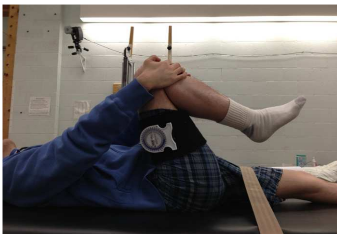
Fig.4: Participants positioning for the hip flexion test

Participants were in the supine position. Pelvic movement was restricted by a strap firmly across the contralateral distal thigh. A fluid inclinometer was attached to a strap around the thigh of the test leg, and zeroed with the leg in a horizontal resting position. The participant then flexed the hip as far as possible with the knee in flexion, until a firm end feel is reached (Figure.4). Hip flexion angle was then measured by the inclinometer relative to the horizontal plane. (Pua, Wrigley, Wrigley, Cowan, & Bennell, 2008).