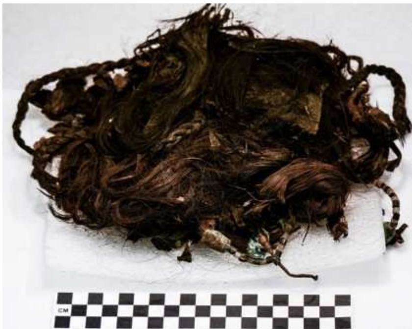
Hair and scalp from Rantoul Woman decorated with thimbles, glass beads, ermine tails, braids, and coins