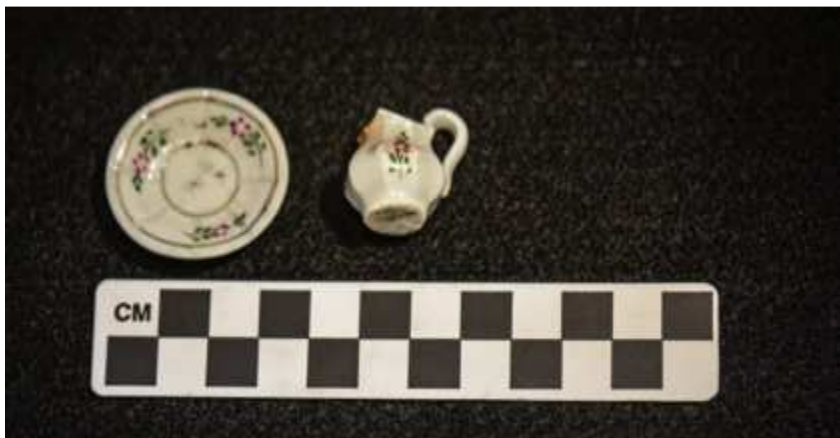
Miniature China Items associated with Rantoul Woman