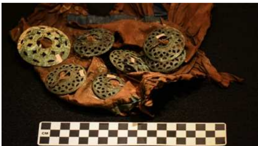
Petticoat fragments with ribbon, German silver brooches, and tinkling cones from Rantoul Woman