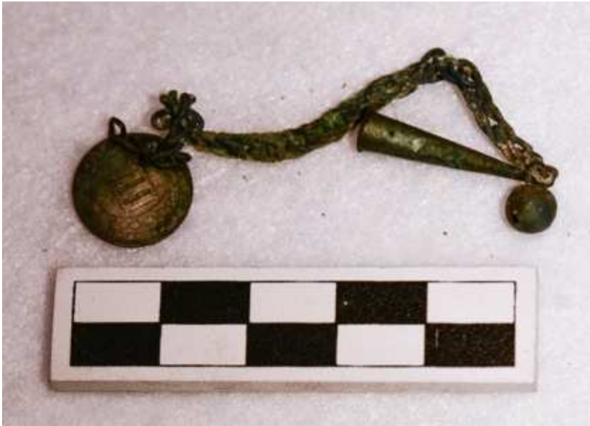
U.S. three cent silver coin used as decoration in Rantoul Woman's hair and clothing