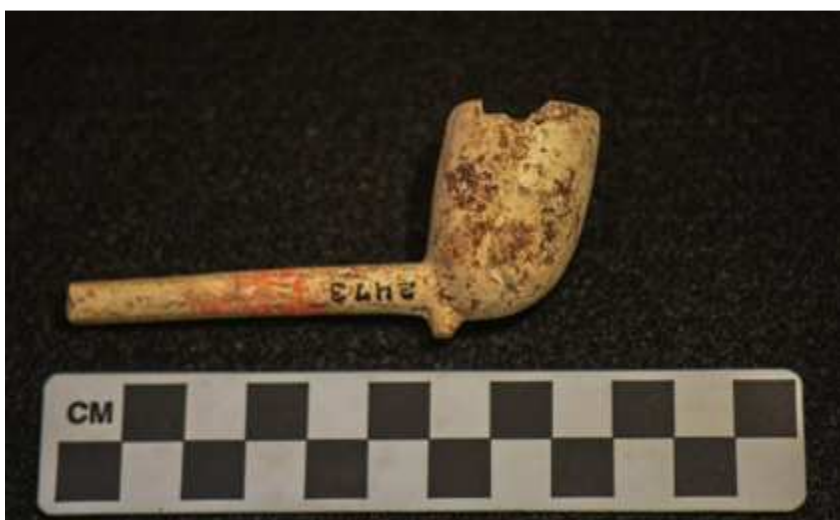
Kaolin pipe associated with Rantoul Woman