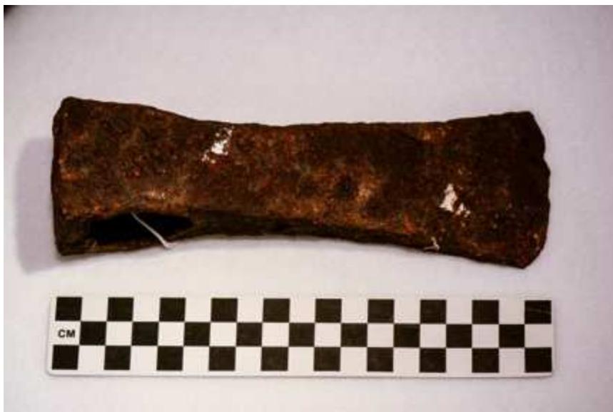
Trade Axe #2- "American" style trade axe associated with the Vilas Co. adult burial.