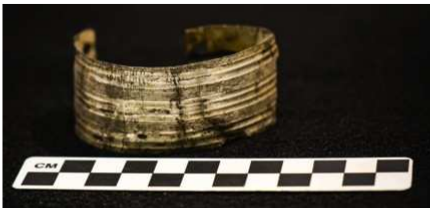
Bracelet #1- German Silver bracelet associated with the Vilas Co. Infant burial