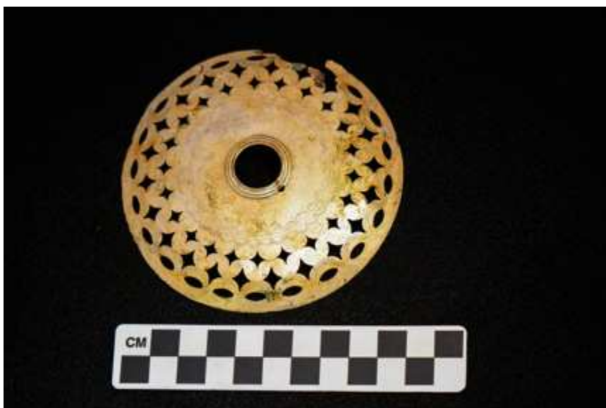
Large German Silver brooch associated with the Vilas Co. Infant Burial