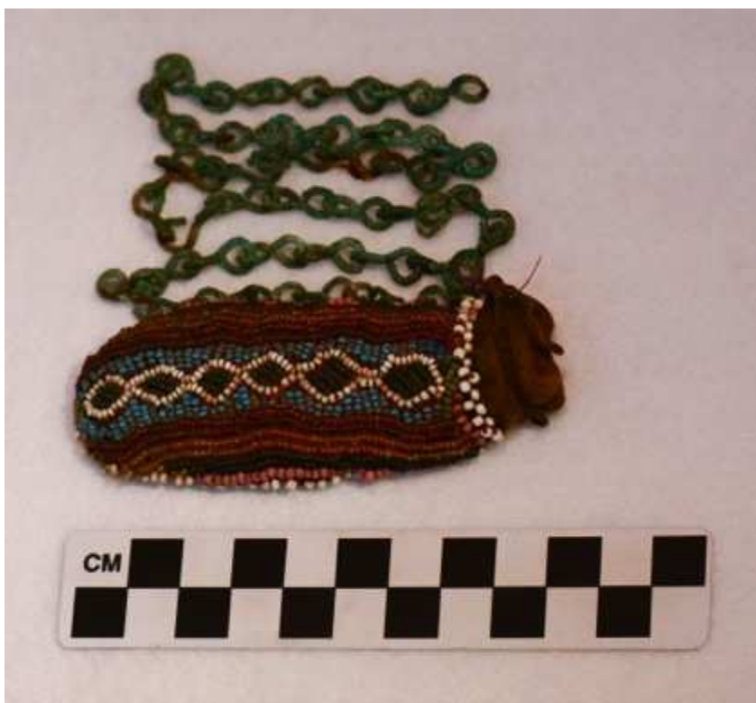
Beaded charm bag (Bag # 6) from Rantoul Woman. This bag is made from hide and seed beads and contains a reed with red ochre.