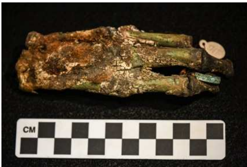
Left hand with fabric, hide, and ring