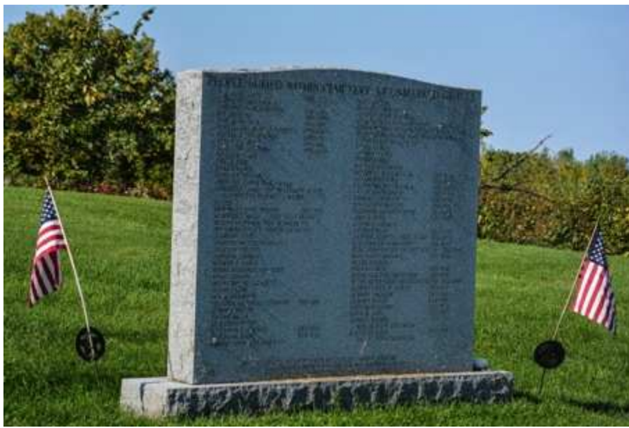
Figure 3.3 Author's photo of the Stockbridge Cemetery near Stockbridge, WI. Most graves are marked with formal headstones; the stone in the image lists all the individuals buried in the cemetery (according to tribal rolls) who are missing headstones.

The Stockbridge were not heavily involved in the fur trade after their arrival in Wisconsin, unlike the Menominee. They self identified as mostly Christian farmers; one of their major concerns during the negotiations with the Menominee had been to find land suitable for farming (Oberly 2005). Early survey maps of Wisconsin tellingly label them “civilized Indians” from New York. They had an organized cemetery directly north of Stockbridge that is now on the National Register of Historic Places. The presence of the Rantoul burial far outside the cemetery and its significant material culture associated with the fur trade makes a Stockbridge affiliation unlikely.