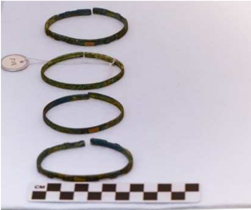
Brass bracelets from Rantoul Woman