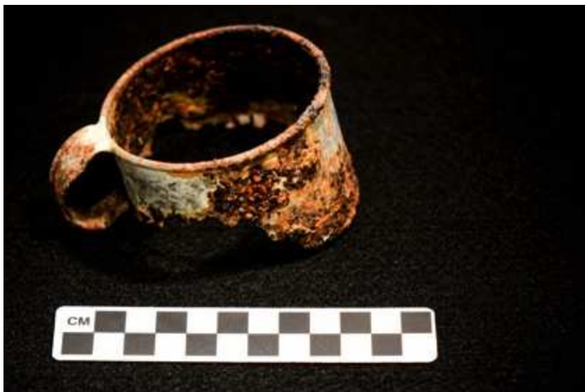
Tin cup with rolled rim associated with the Vilas Co. Infant burial