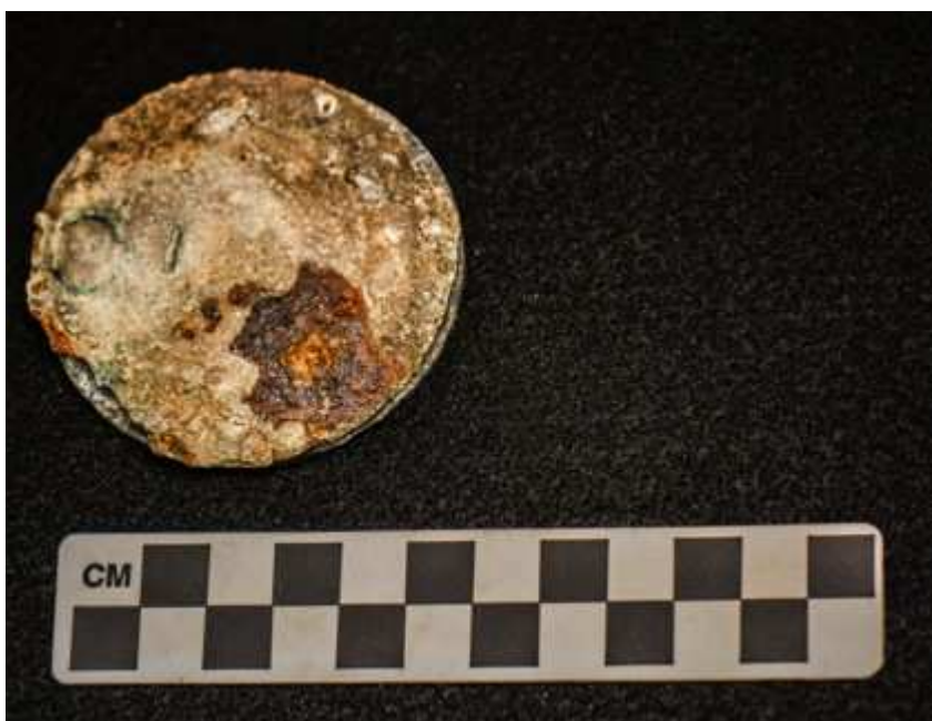
Pocket mirror with hanger associated with the Vilas Co. Infant burial