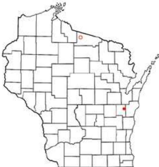
Figure 1.1 Map Showing approximate locations of Rantoul in Calumet Co., WI and Rest Lake in Vilas Co., WI. Rantoul is indicated with a red dot and Rest Lake with a red and white dot.