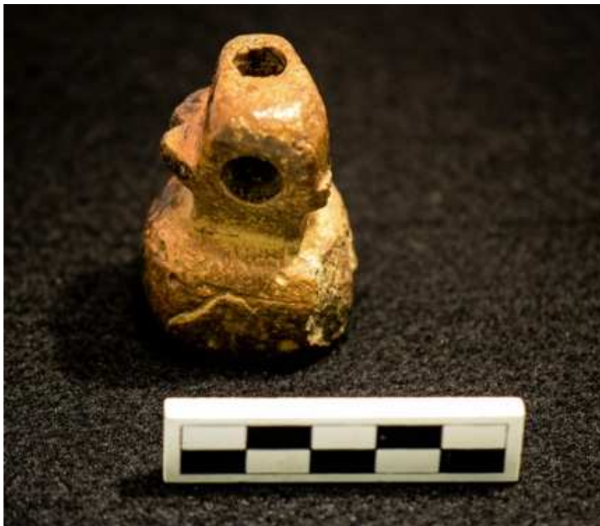
Stone Micmac pipe associated with the Vilas Co. Adult burial