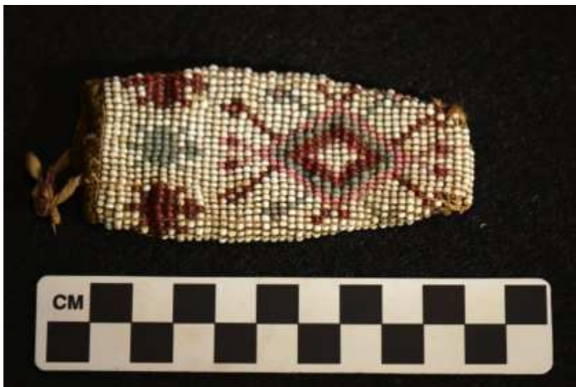
Beaded charm bag (Bag # 2) from Rantoul Woman; made with seed beads, and twine/hemp