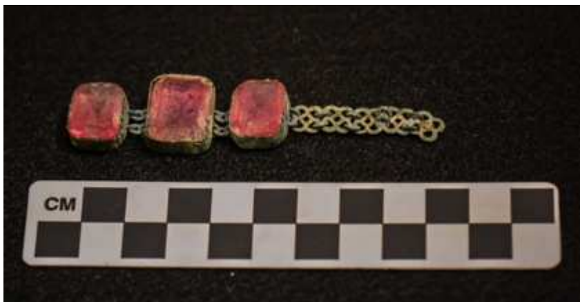
Necklace with red glass jewels associated with the Vilas Co. Infant burial