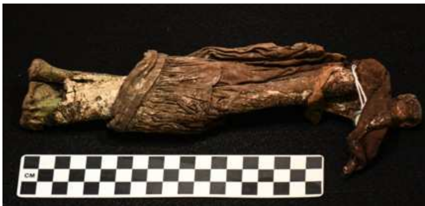
Right ulna and radius with skin and blouse fragments from Rantoul Woman