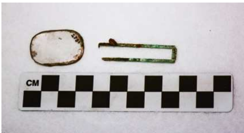
Rectangular Spectacle Glass and arm dated from 1800-1840 and associated with the Vilas Co. Adult burial.