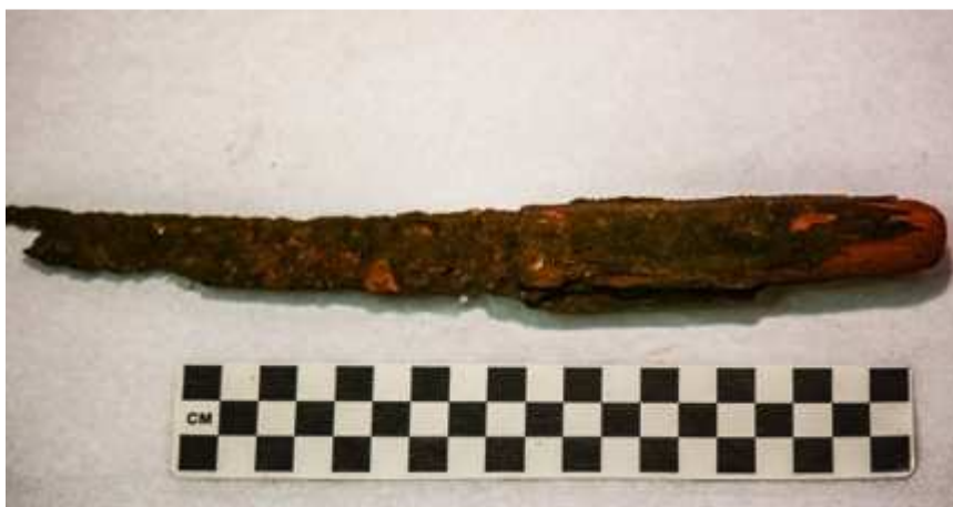
Knife association with the Vilas Co. Adult burial