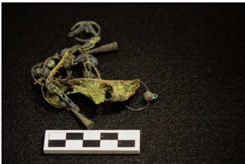
Dessicated ear tissue with cone and ball tinkler decorations, chain, and coins