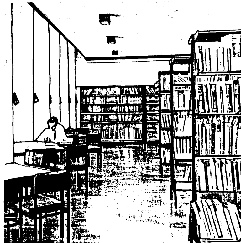
DECONSHIRE (WARD & ODD 1973)

fication system helps group all books on a similar subject in the same place - a distinct advance on the old accession shelving method. A small library is in a very unique position to experiment with other ways of bringing materials and people than relying on a card catalog which is very difficult for even trained college graduates to use, and a stack shelving arrangement which makes subject groupings more difficult to perceive. The current systems of finding materials constitute a barrier which must be overcome, and which non-users of libraries cannot be expected to manage.