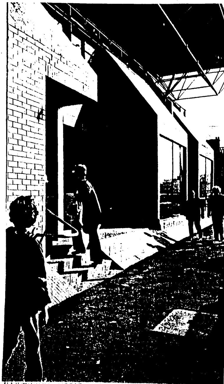
AVONHEAD LIBRARY (ARCHITECTURAL REVIEW MAY 14)

Thirdly, there are the intangibles inherent in the idea of library. "Why I had to care for the books I borrowed, return them unscarred and on time, was because they weren't my property alone, they were everybody's. That idea had as much to do with civilizing me as any idea I was ever to come upon in the books themselves." (Philip Roth, 1978)