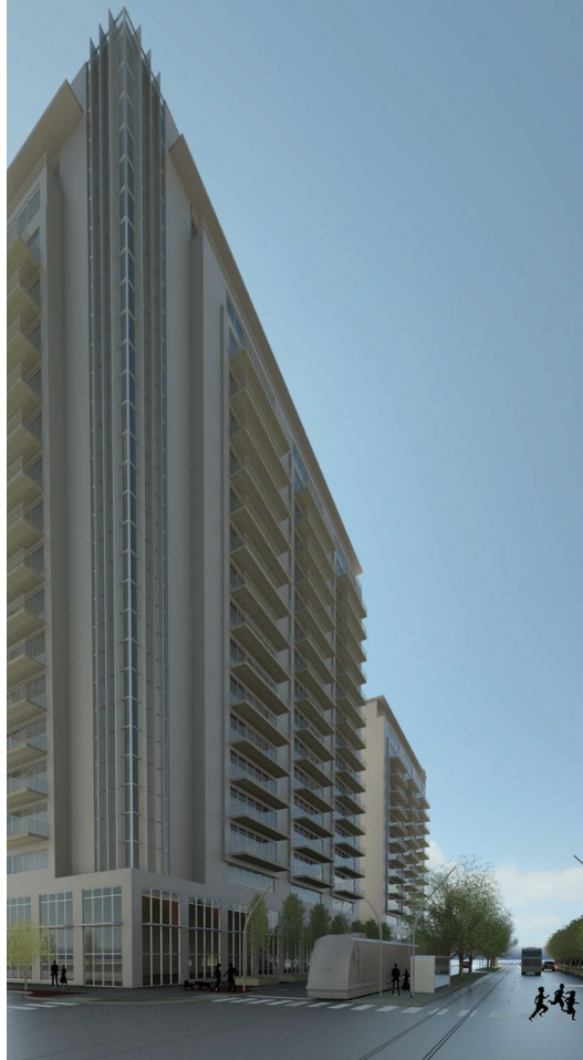
mixed-use building off 4th Street south of State Street

4th Street is enhanced with pedestrian plazas, street car stops, landscaping, and sustainable materials. Lighting provides an exciting night atmosphere on a quiet night, as well as game night. It also runs along the street to highlight new stops for the streetcar, which is protected by a series of trees. Seating is integrating throughout the improved corridor to invite people to rest, watch, or meet friends and enjoy the new entertainment options.