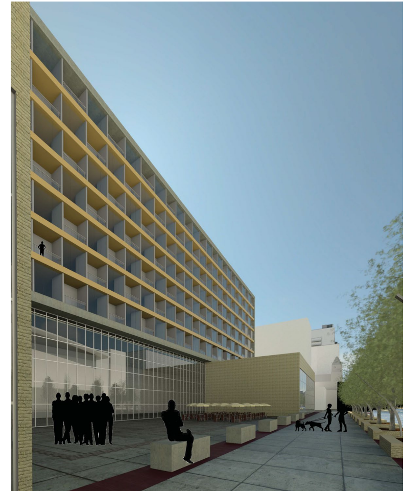
right: mixed-use entertainment zone off 4th St. north of Highland Ave.