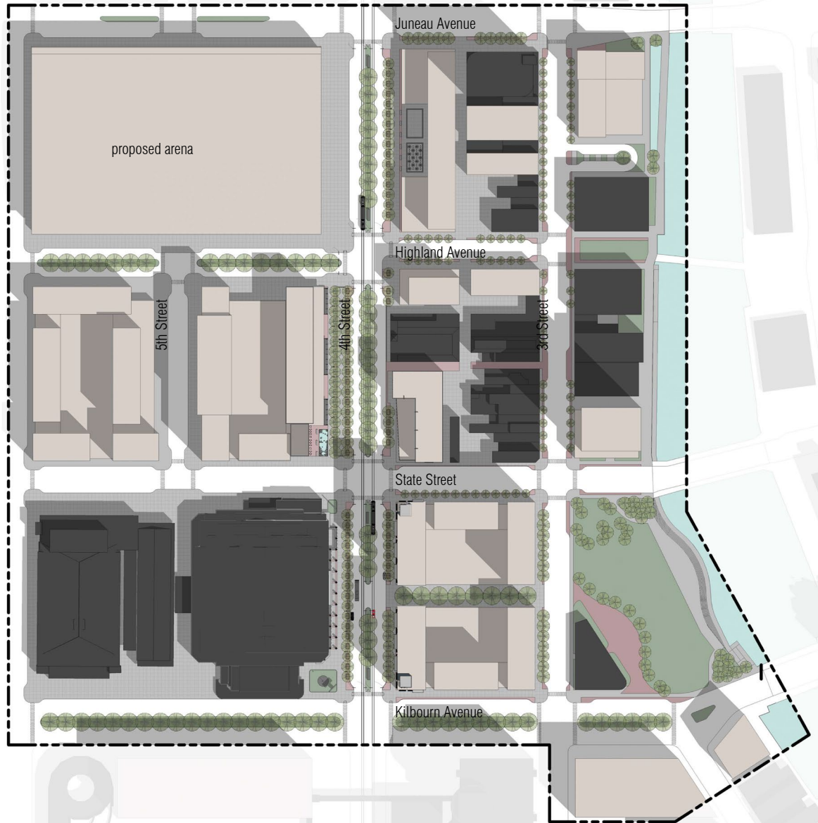
opposite: site plan