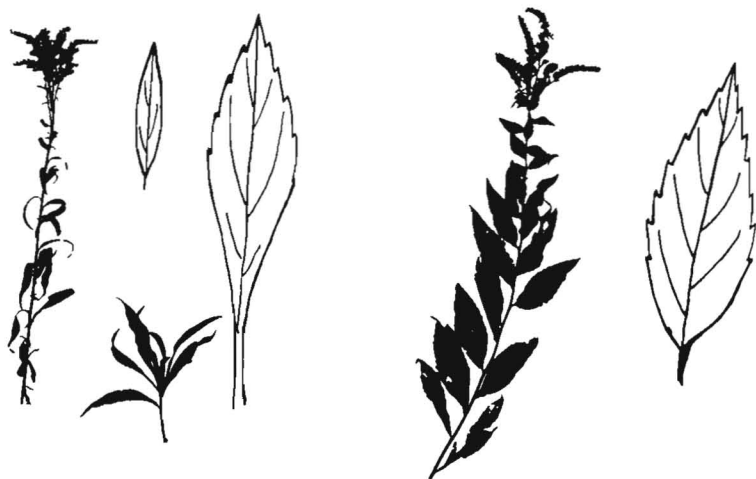
11. Early Goldenrod