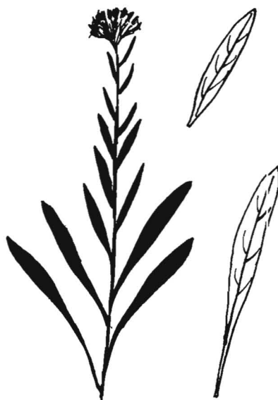
16. Ohio Goldenrod