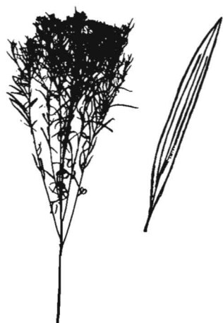
13. Grass-leaved Goldenrod