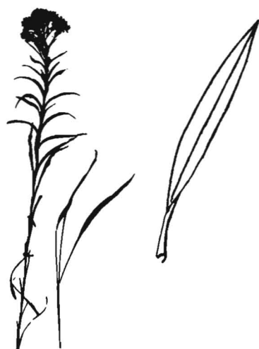
14. Riddell's Goldenrod