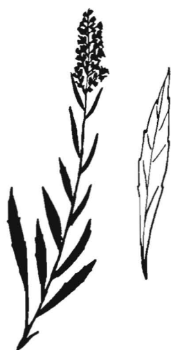
5. Swamp Goldenrod