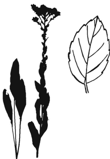
15. Rigid Goldenrod