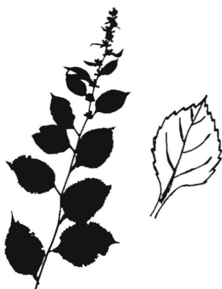
3. Zig-zag Goldenrod