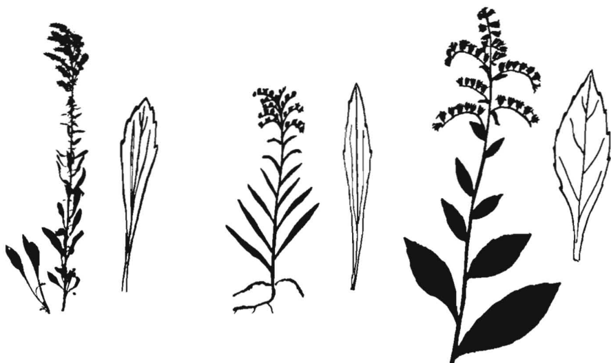
8. Old Field Goldenrod 9. Missouri Goldenrod 10. Roughleaved Goldenrod