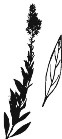
4. Showy Goldenrod