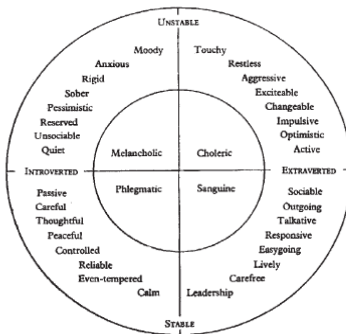
Figure 1. Eysenck's Theory of Personality. Adapted from "Biological basis of personality" by H.J. Eysenck, 1963, Nature , 199, p. 1032.

However, the Extraversion-Introversion factor is only one half of Eysenck's Theory of Personality. The other factor, the Neuroticism-Stability factor, describes the level of Neuroticism (N) an individual displays. Individuals scoring high in N "tend to be emotionally over-responsive and to have difficulties in returning to a normal state after emotional experiences" (H.J. Eysenck & Eysenck, 1968, p. 6). The higher level of N, the more emotional liability and over reactivity an individual displays. According to Eysenck's theory, the Extraversion-Introversion and the Neuroticism-Stability factors intersect to form four groups of individuals: Melancholic, Phlegmatic, Choleric, and Sanguine. These groups and factor scales, along with corresponding personality traits, can be seen in Figure 1.