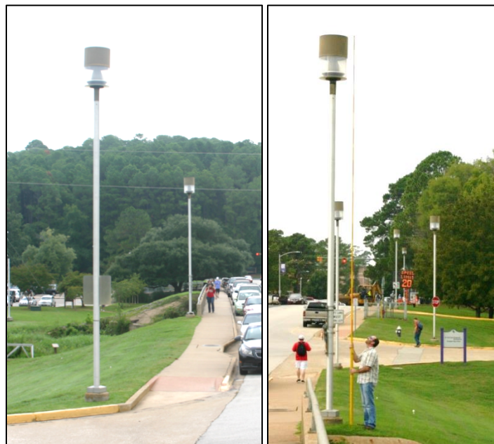
Figure 1. Measuring light pole height with a telescopic height pole on the campus of Stephen F. Austin State University, Nacogdoches, Texas.

The light pole was located along the side of E. College Street on the residential campus of SFASU. A light pole within a small town urban environment was chosen to provide a full view, both top and bottom, of a vertical feature clearly identifiable from all four cardinal directions and to ensure no change in height between in situ measurement and Pictometry® oblique image acquisition during February and March, 2013. The actual height of the light pole was measured during September, 2013 in situ with a telescopic height pole in 2.54 centimeter increments (1 inch increments) by a graduate research assistant within ATCOFA (Figure 1). The actual height of the light pole was confirmed as 7.47 meters. Then, the height of the same light pole was estimated onscreen using Pictometry® imagery via a web-based interface during September, 2013 by an ATCOFA faculty member.