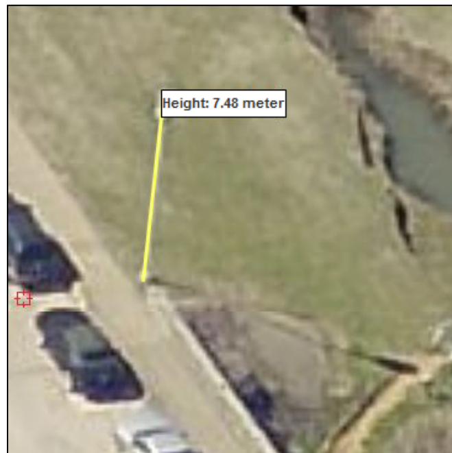
Figure 4. Measuring the height of the light pole within the Pictometry® web-based interface from an East perspective at 300% magnification.