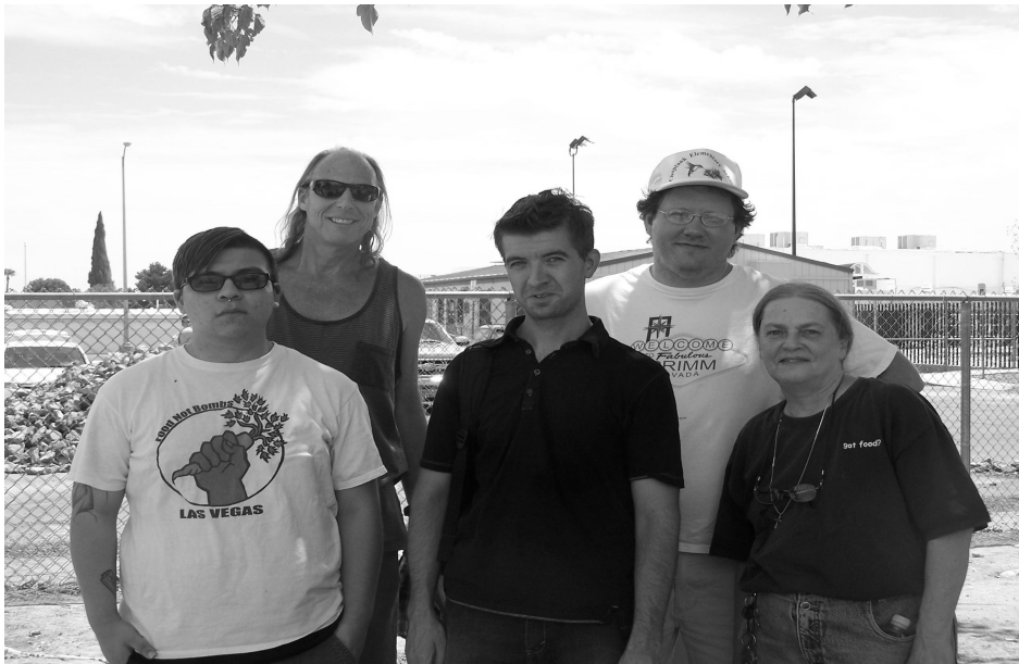
Fig 3.2: Author with FNBLV activists