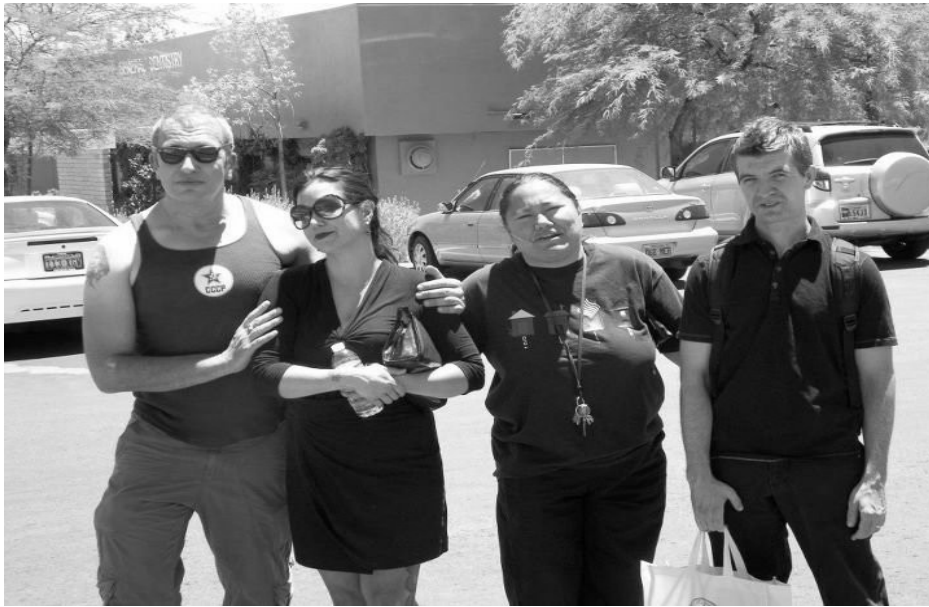
Fig 3.3: Author with members of Project Aqua

were removed, and most of the park's open space was converted to irrigated soccer fields. Throughout the summer of 2013, FNBLV discussed a move to Jaycee Park, about 1 mile east of Baker Park, and well outside of the downtown core of Las Vegas.