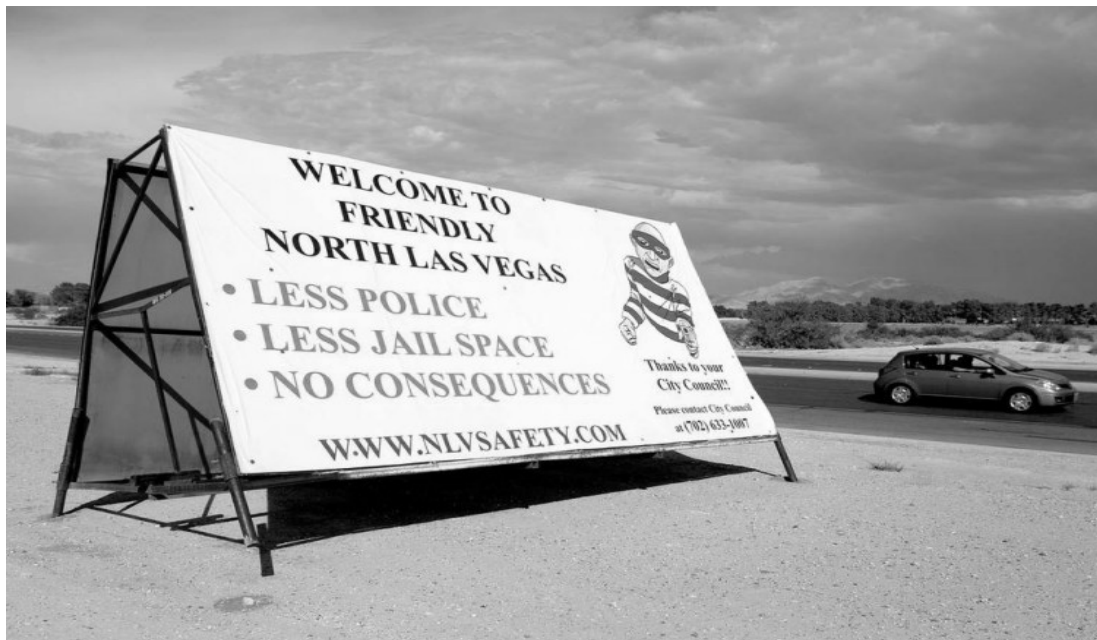
Fig 1.3: Budget crisis – not just for the central city.

Additionally, it has narrowly avoided municipal bankruptcy in the last few budget cycles. One way the city avoided bankruptcy was to close city jails and transfer prisoners to the Clark County Detention Center in downtown Las Vegas. A city council proposal to slash its police force was met by anger from local residents and prompted the police union to erect a series of chilling billboards near the borders of the city ( Fig. 1.3 ).